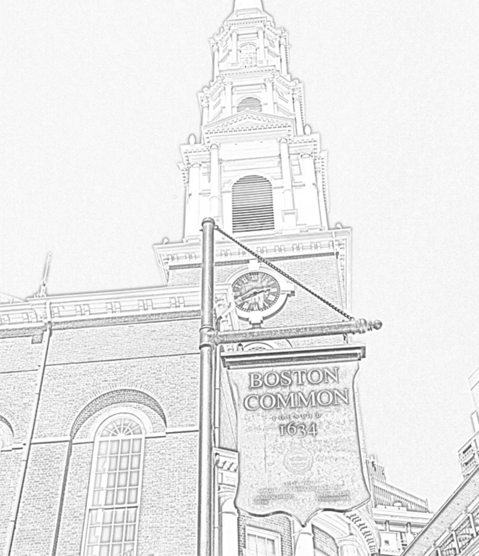
The Boston Common, founded in 1634, is America's first public park.