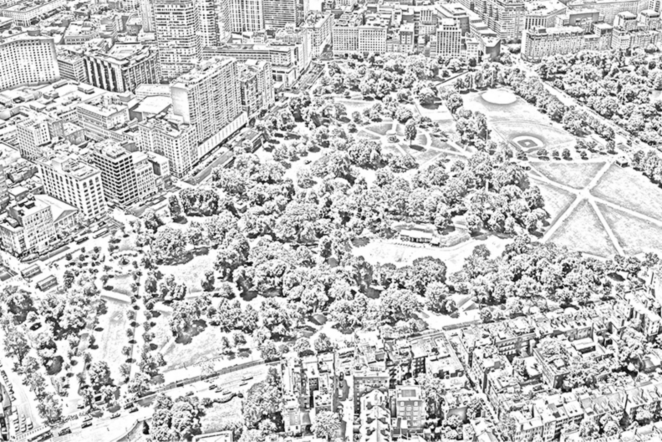
For 50 years the Friends of the Public Garden has helped the City care for three downtown parks: the Boston Common, the Public Garden, and the Commonwealth Avenue Mall.